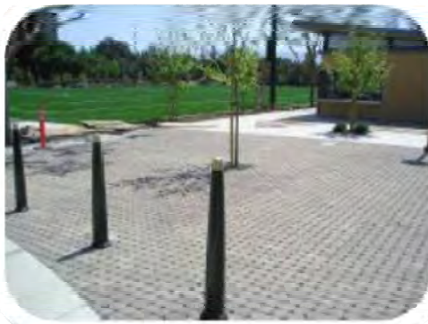
Permeable Interlocking Concrete Pavers

Bay Area Stormwater Management Agencies Association